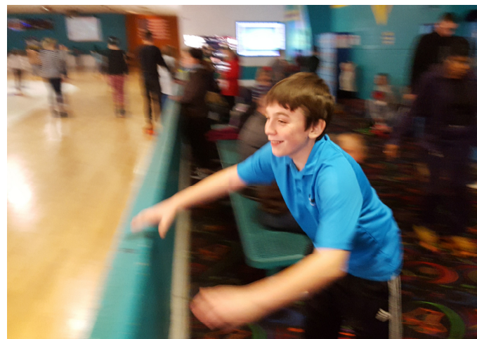
Youth Group Skating Day, January 14, 2018