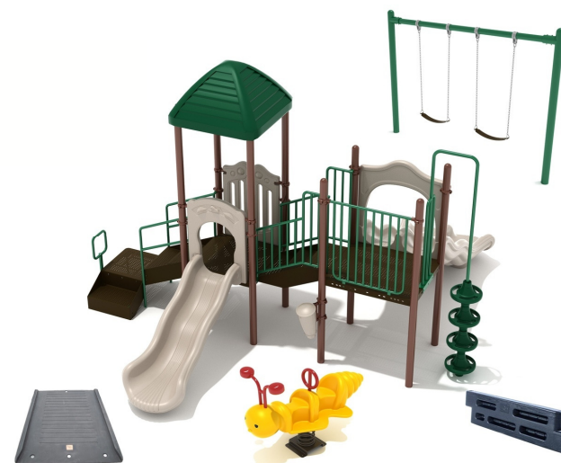
Future Playground of the Gathering at Scott Memorial UMC