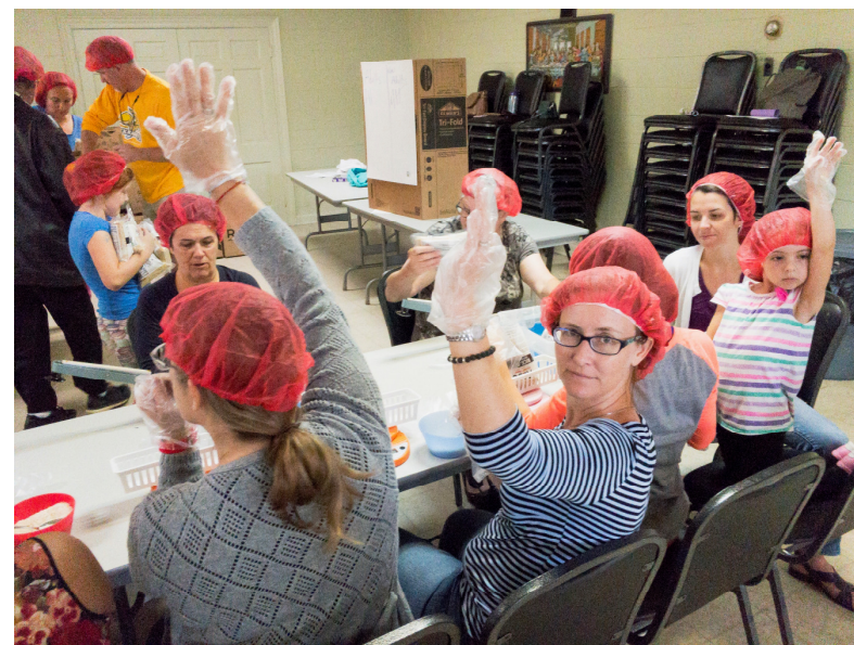
Rise Against Hunger Event held on Sunday, November 5, 2017 at the Gathering at Scott Memorial UMC